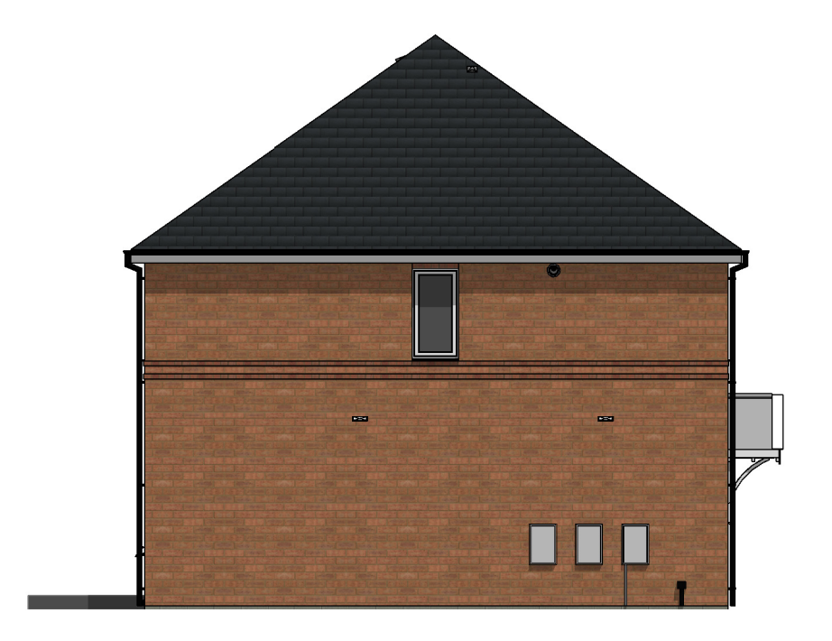
Left Elevation. 1:100