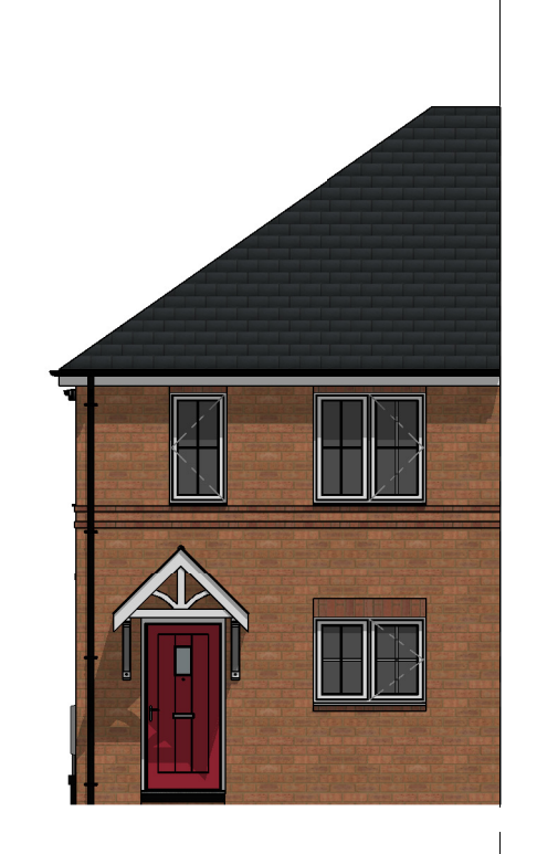
Front Elevation. 1:100