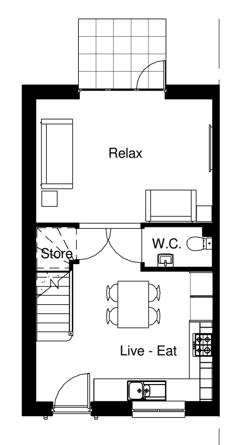
Ground Floor. 1:100